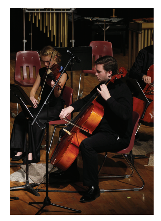
Central Christian's Music Department strives to engage, inspire and discover excellence.

We are grateful to offer your child the opportunity to take advantage of this private lesson scholarship.